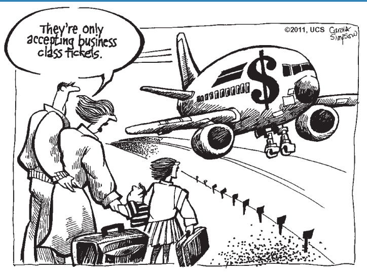
The Economy Takes Off